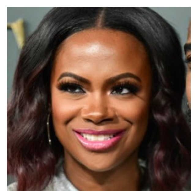
Kandi Burruss' Adorable First Photo of Baby Girl Revealed