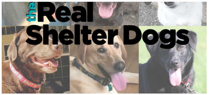
Meet the Real Shelter Dogs of Lab Rescue LRCP 1 year ago