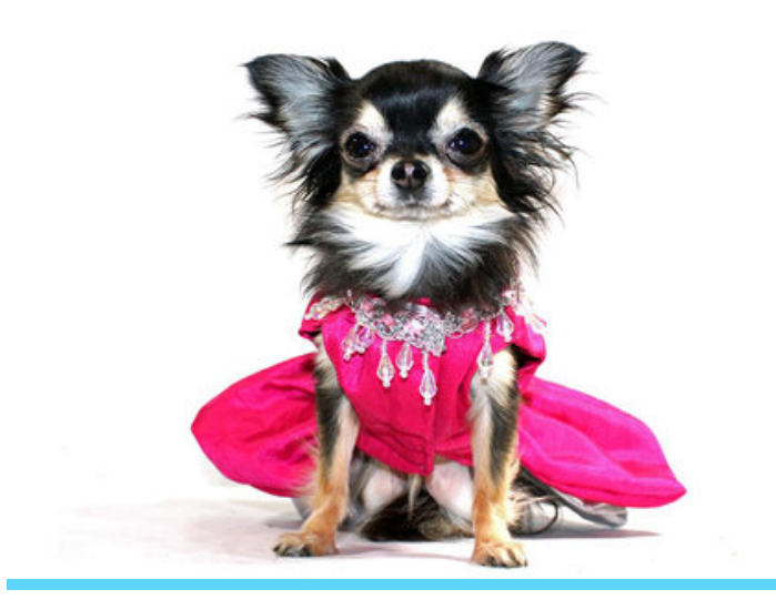
Quiz: What is Your Dog's Ideal Statement Piece?