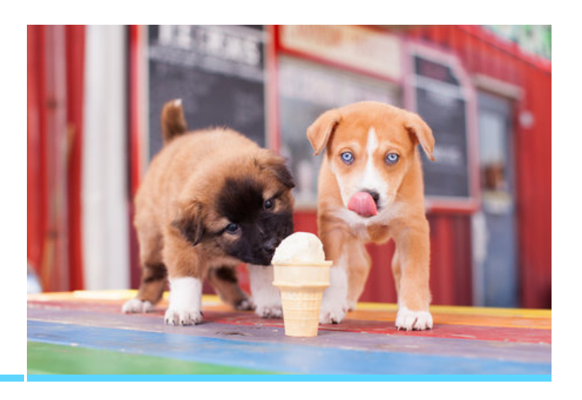
UNLEASHED Pick a Puppy & We'll Tell You Your Favorite Ice Cream

Unleashed is Bravo's celebration of pamper-worthy pets and how to spoil them. Want more? Then Like us on Facebook to stay connected to our daily updates.