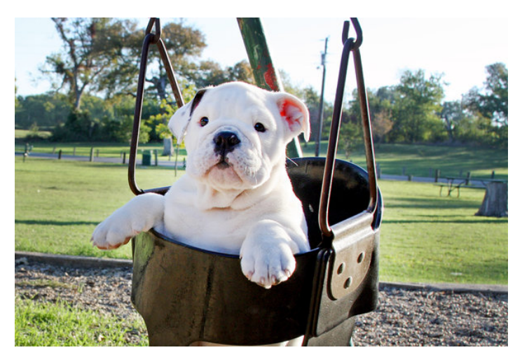
Summer Is in Full Swing for These Cute Swinging Pups 1 year ago