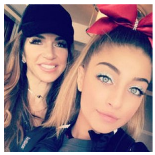
Ever Seen BRAVOTV.COM

How Much Does It Cost to Rent the Yachts on 'Below Deck'? THELIST.COM