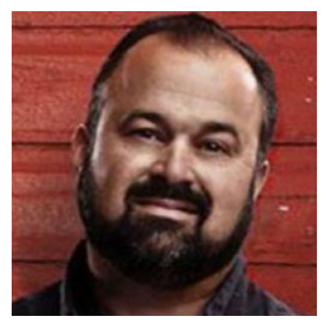
The History Channel's Biggest Scandals Ever GRUNGE.COM