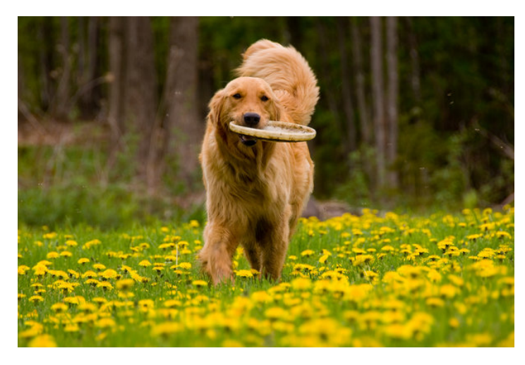
9 Indisputable Facts About Anyone Who Has a Golden Retriever 1 year ago